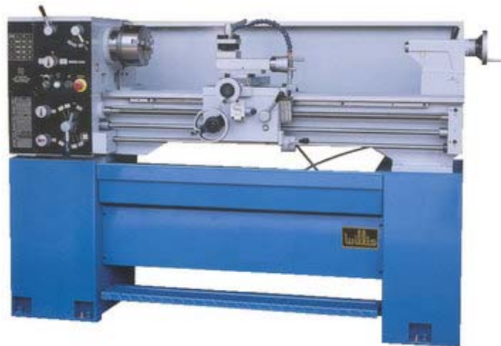
1440E Machine Shop Lathe

Willis 1440E geared head lathes utilize an all cast iron body, much like all Willis conventional metalworking lathes and CNC metal turning lathes , the Willis 1440E lathe also maintains hardened & ground headstock gears and shafts as well as hardened and ground bed ways.