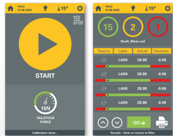
New easy to use touch screen operator interface.