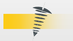
Exclusive helix tilting system by Sylvac, for more comprehensive thread measurements.