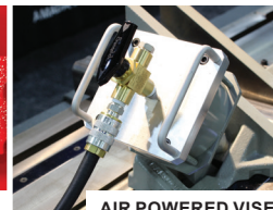
AIR POWERED VISE