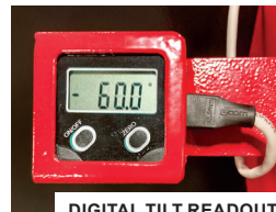
DIGITAL TILT READOUT

CAPACITY: 15" x 20" (381 x 508 mm) BLADE WIDTH: 1.25" (32 mm)