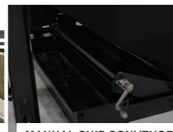
MANUAL CHIP CONVEYOR