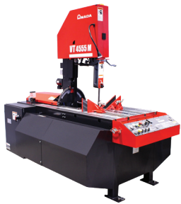
VT4555 *(8-MARK II) MANUAL COLUMN RETURN

CAPACITY: 18" x 22" (457 x 560 mm) BLADE WIDTH: 1" (25 mm)