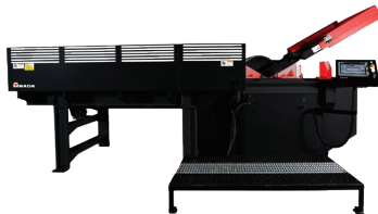
VT7995M *(800M) SEMI-AUTOMATIC

CAPACITY: 18" x 22" (457 x 560 mm) BLADE WIDTH: 1.25" (32 mm)