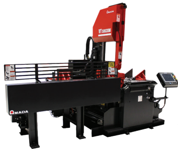
VT5063MW *(2150M) SEMI-AUTOMATIC

CAPACITY: 18" x 22" (457 x 560 mm) BLADE WIDTH: 1" (25 mm)