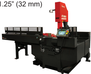
VT3850A *(380APC) AUTOMATIC

CAPACITY: 31.25" x 37.5" (794 x 952 mm) BLADE WIDTH: 2" (51 mm)