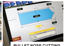
BULLET NOSE CUTTING