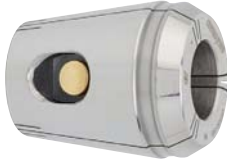
Precision Collets GER-WD 5 µm