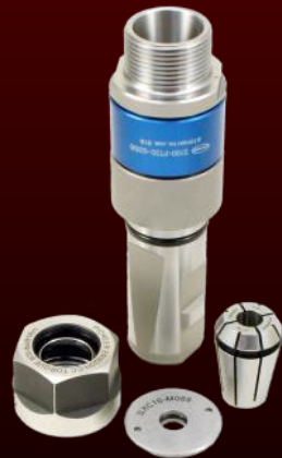
Showing PT holder, coolant nut, coolant cap & tap collet.