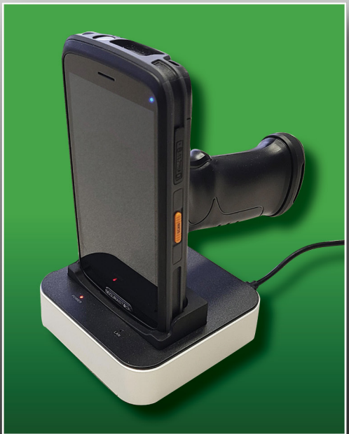
SCAN IN CHARGING STAND