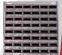
48 Lid Max Density 3.65" x 1.12" x 1.01"

*dimensions listed are lid openings; depth is dependent on drawer type