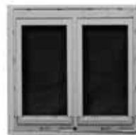
2 Lid Standard Density 10.83" W x 20.07" H