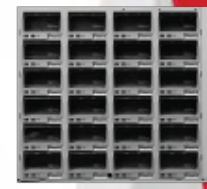
24 Lid High Density 4.96" W x 2.21" H