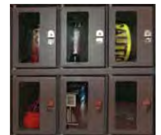
6-Door / Model SLM6 Inner: 5.8"W x 8.5"H Opening: 3.44"W x 7.01"H