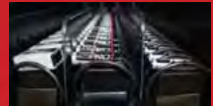
Battery Risers Available

SupplyPro experts work with you to ensure that your individual dispensing needs are met; accurately and efficiently.