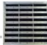
24 Long Lid Max Density 7.48" x 1.12" x 1.01"