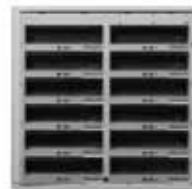
12 Lid Standard Density 10.83" W x 2.21" H