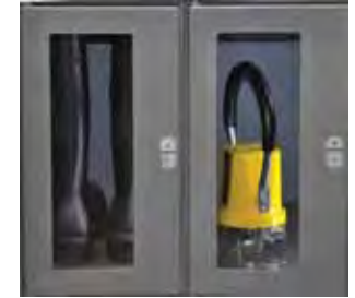
2-Door Vertical / Model SLM2V Inner: 8.5"W x 17.9"H Opening: 7.01"W x 15.48"H