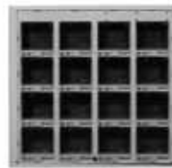
16 Lid High Density 4.96" W x 4.02" H