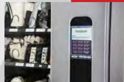
Embedded Touch Screen Controller

A completely integrated touch screen controller with greater functionality. SupplyPro's unique and proprietary swivel design makes administration of the SupplyBay 5 the simplest and most practical by positioning the controller inside the door for immediate access.