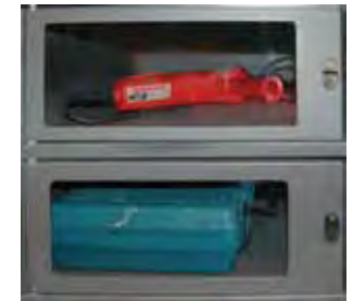
2-Door Horizontal / Model SLM2H Inner: 17.9"W x 8.5"H Opening: 15.48"W x 7.01"H