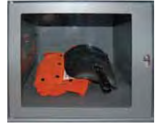
1-Door / Model SLM1 Inner: 17.9"W x 17.2"H Opening: 15.48"W x 15.65"H