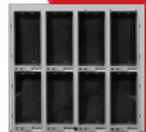
8 Lid Standard Density 4.96" W x 9.50" H