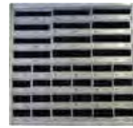
36 Lid Max Density 24: 3.65" x 1.12" x 1.01" 12: 7.48" x 1.12" x 1.01"