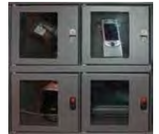
4-Door / Model SLM4 Inner: 8.8"W x 8.5"H Opening: 6.42"W x 7.01"H