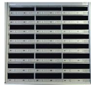
24 Long Lid** Max Density 7.48" x 1.12" x 1.01"