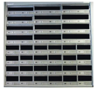
36 Lid** Max Density 24: 3.65" x 1.12" x 1.01" 12: 7.48" x 1.12" x 1.01"