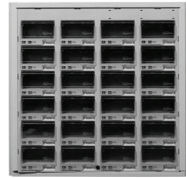
24 Lid High Density 4.96" W x 2.21" H