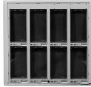
8 Lid Standard Density 4.96" W x 9.50" H