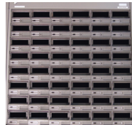
48 Lid** Max Density 3.65" x 1.12" x 1.01"

**due to the "v" shape design of the high density cover the useable space is .78" x 1.01"