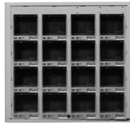
16 Lid High Density 4.96" W x 4.02" H