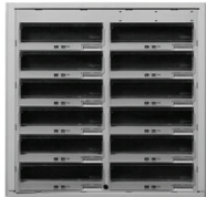
12 Lid Standard Density 10.8" W x 2.21" H