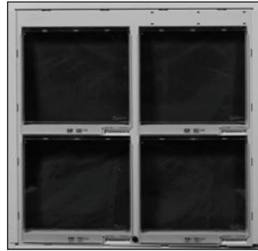
4 Lid Standard Density 10.83" W x 9.50" H Est. lbs. per Secure Bin: 25.00 Max lbs. per drawer: 100