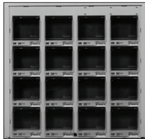
16 Lid High Density 4.96" W x 4.02" H Est. lbs. per Secure Bin: 6.25 Max lbs. per drawer: 100