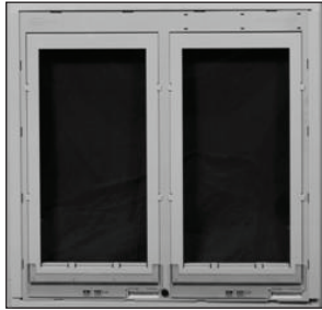
2 Lid Standard Density 10.83" W x 20.8" H Est. lbs. per Secure Bin: 25.00 Max lbs. per drawer: 50