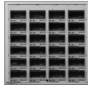
24 Lid High Density 4.96" W x 2.21" H Est. lbs. per Secure Bin: 4.16 Max lbs. per drawer: 100