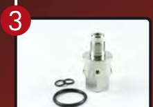
Dual Inlet Abrasive Body for .281 nozzles

NOTE: All abrasive bodies come with inlet O-rings and nozzle nut O-rings.