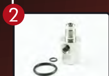
Abrasive Body for .281 nozzles