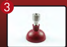
4" Nozzle with Nozzle Guard (.281 only)