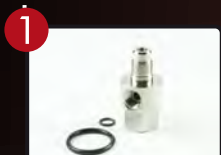
Abrasive Body for .300 nozzles