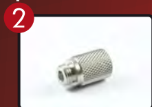
Inlet for 3/16" tubing

NOTE: Two Inlets are included if option 3 (dual inlet) is selected above.