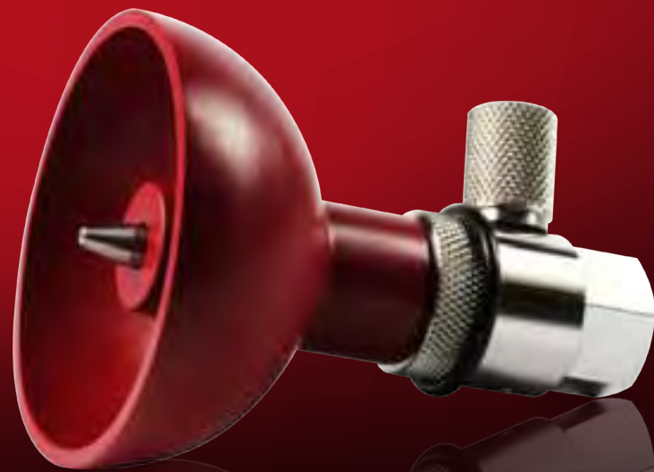
.300 DialLine shown with 3/16" Inlet, 3" nozzle and protective spray guard. 13904-1-2-2