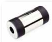
High Pressure Cylinder Part # 11117 Replaces 007038-3, TL-001002-3

AccuStream, Inc. is in no way affiliated with the above mentioned manufacturer. Manufacturer part numbers are for convenience only.