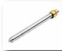
Roctec 500, .281 x .040 x 4" Part # 11277-040-40-PR Replaces 014194-40-40