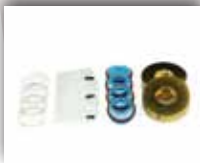
HP Seal Kit, 60K Part # 11135 Replaces 001198-1, TL-001001-1