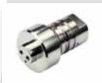
Check Valve Body, 60K Part # 11115 Replaces 004383-3, TL-001003-3