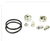
Check Valve Repair Kit Part # 11282 Replaces 010642-1, 015866-1, TL-001004-1