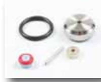
OnOff Valve Repair Kit 100K Part # 13429 Replaces 301927