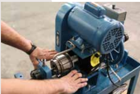
Automated coning and threading operation

Our in house manufacturing capabilities enable AccuStream to provide quick turn-a-round on custom high pressure tubing. The automated coning and threading machine produces near perfect threads, ensuring trouble-free HP connections. Custom bending to any specification is also available. Same day shipping is routinely accommodated!