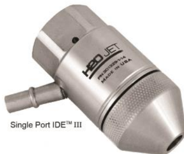
Single Port IDE™ III