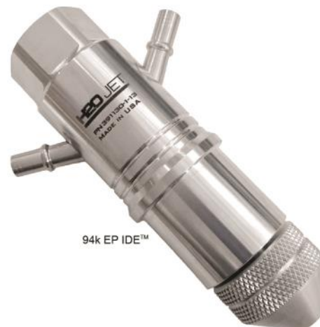
94k EP IDE™