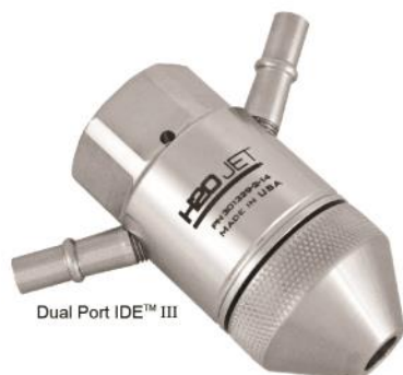
Dual Port IDE™ III