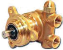
F300-P0640-0000 Charge Pump 140 GPH Replaces: 203899, 11995, WO203899