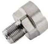
F300-D0009-0000 MJ5 to DP3000 Adapter