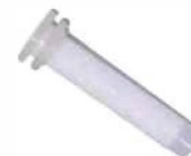
F300-D0019-0000 Final Filter w/O-Ring Replaces: 304351, 13195, WO304351, 2055