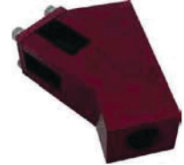
F300-E0020-0000 Anti-Backwash Valve