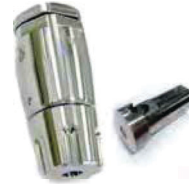
F300-K0XXX-0000 DP-E Cutting Head Available in: Diamond or Ruby