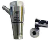
F300-K0047-xxxx DP3000 Cutting Head Available in: Ruby