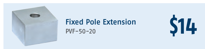
Fixed Pole Extension PVF-50-20