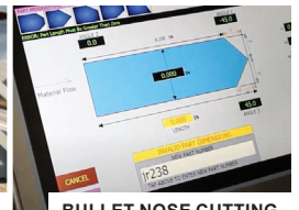
BULLET NOSE CUTTING