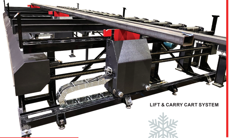
LIFT & CARRY CART SYSTEM