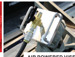
AIR POWERED VISE