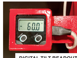
DIGITAL TILT READOUT

CAPACITY: 15" x 20" (381 x 508 mm) BLADE WIDTH: 1.25" (32 mm)