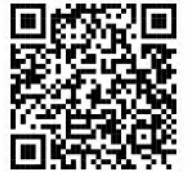
TC-F Series VIDEO