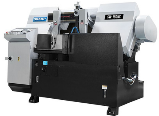
AUTOMATIC INDEXING PRODUCTION CUT OFF SAW